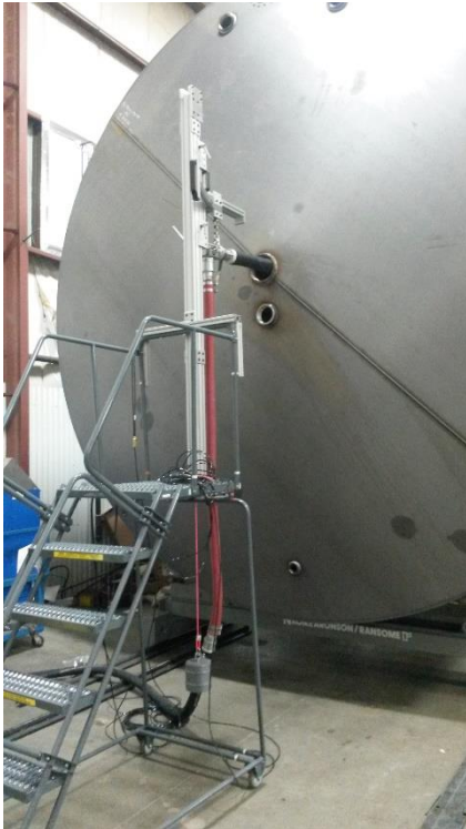
The Stand was developed by CMD to reach the tank openings

As a systems integrator, Controlled Motions are not limited in creating solutions because they utilize electric, hydraulic or pneumatic technology, based on providing the proper solution for the customer's project and budget.