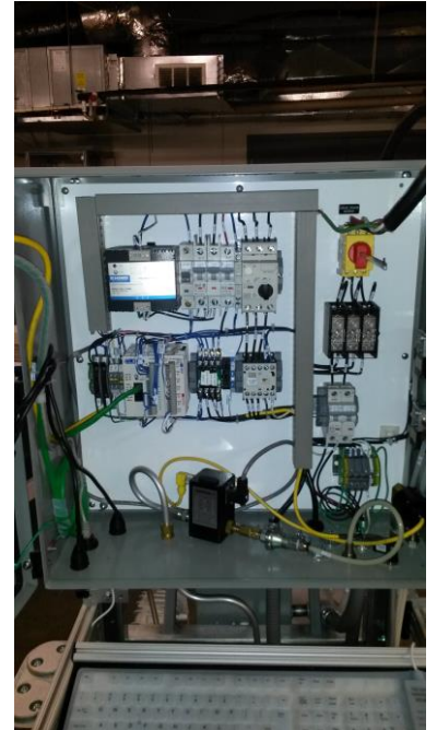
Control Panel internals