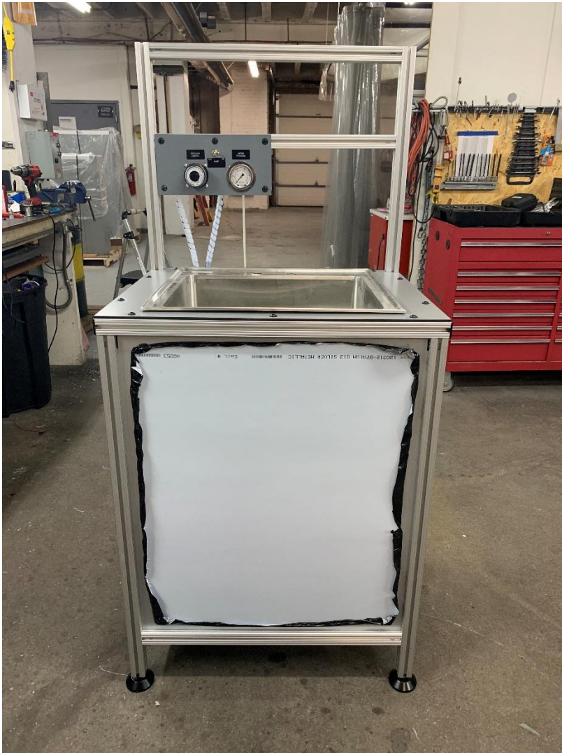
Overall view of the test station