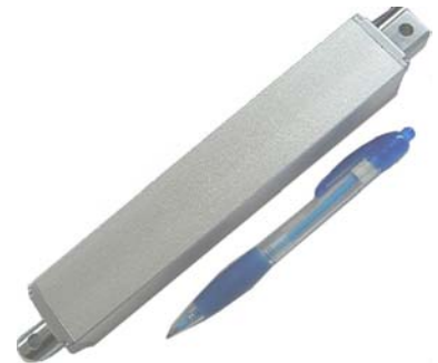
Mini-actuator as compared to pen

Controlled Motion Dynamics met the customer's specific requirements by designing an 80/20 slide assembly. The assembly was easily bolted into the customer's existing framework. Mounting the small actuator to the 80/20 slide, Controlled Motion Dynamics also built the custom RS232 interface. Prior to shipping, CMDI fully constructed and tested the actuator. After the customer installed and tested the actuator it was so pleased that fifteen additional actuators were ordered.