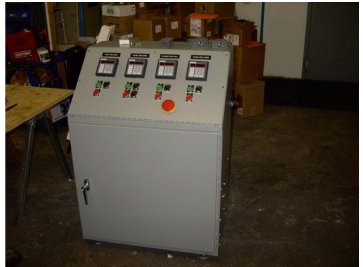
Photos (on left): Inside views of control panel, (at top) outside view of the control panel